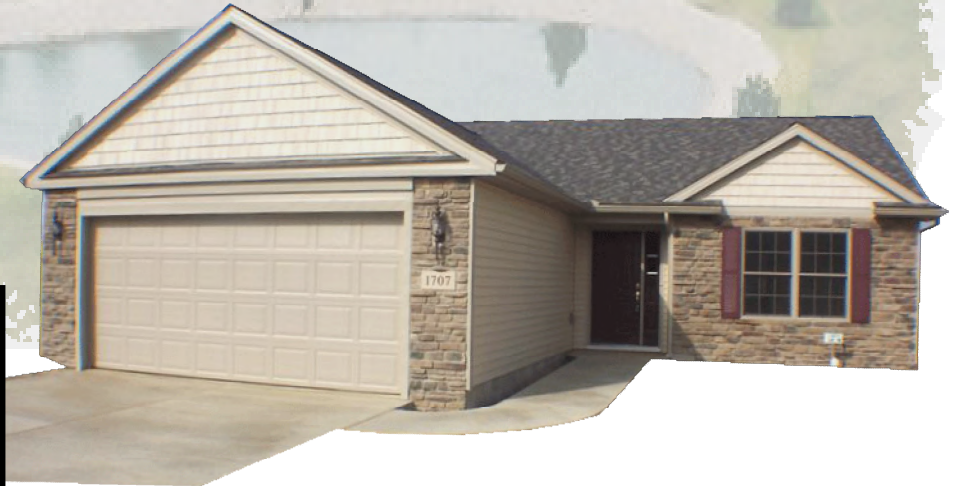
The Aspen 1,500 sq ft